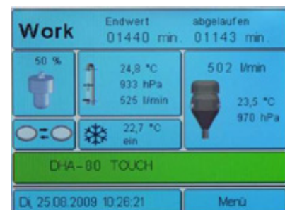
Figure 2: Touch screen

averaged by the control. A real-time protocol states sampling volumes yielding from the sampling time and controlled volume flow as the core information. The air is released from the instrument with reduced noise through the noise baffle (7). The sampling protocol lists the effective and the standardized averaged values of pressure and temperature for that period and the operating as well as the failure status. The DIGITEL HVS DHA-80 has a magazine of 15 filters stretched in filter holders. They are automatically changed to the flow position at the pre-set time.