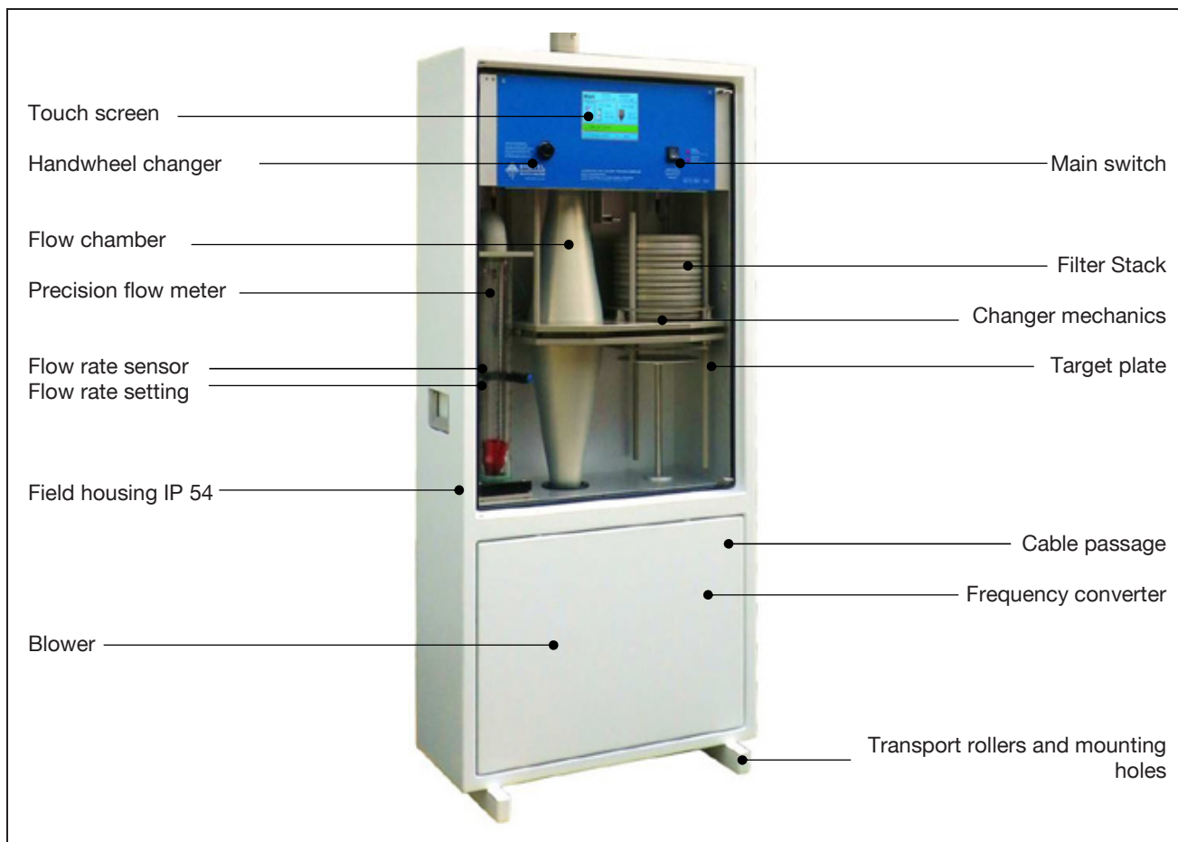
Figure 3: Components

We are building high-precision samplers for dust, gas and rain since 1970.